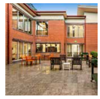
Architect: Morrison Design Partnership